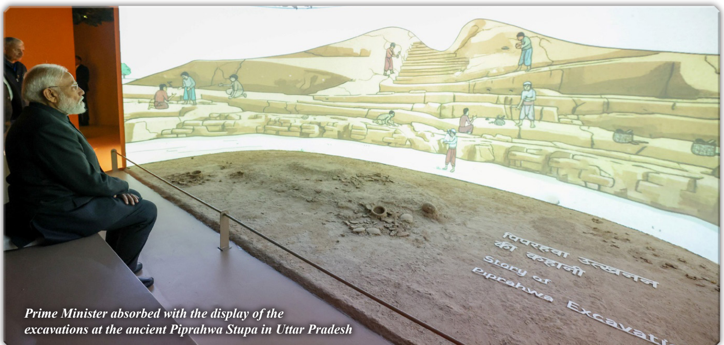
Prime Minister absorbed with the display of the excavations at the ancient Piprahwa Stupa in Uttar Pradesh

The inauguration was attended by parliamentarians, ministers, members of the diplomatic corps, ambassadors, venerable Buddhist monks, senior government officials, scholars, heritage experts, members of the art fraternity, students, and followers of Buddha Dhamma from India and abroad. ■