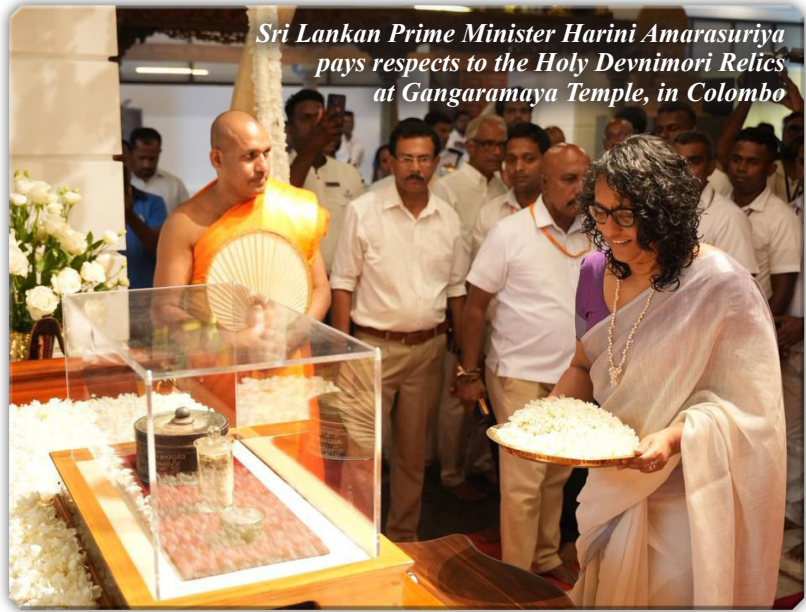
Sri Lankan Prime Minister Harini Amarasuriya pays respects to the Holy Devnimori Relics at Gangaramaya Temple, in Colombo

Sri Lanka’s High Commissioner to India, Ms. Mahishini Colonne , described the exposition of the sacred relics as a ‘rare blessing’ for the country, and expressed gratitude to the Government of India for making the historic event possible.