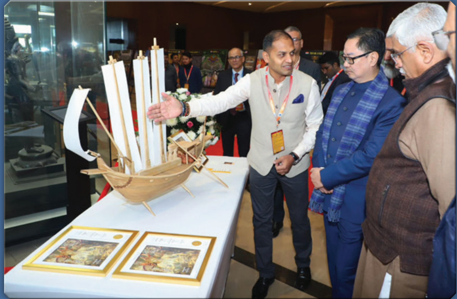
Mr Ankur Naik of the Prasad Pawar Foundation explaining the details of the boat to Union Minister for Parliamentary Affairs and Minority Affairs, Shri Kiren Rijju and Union Minister for Culture and Tourism, Shri Gajendra Singh Shekhawat

Among the many narrative elements in the Ajanta murals, the boat motif holds profound historical and spiritual significance. In Buddhist symbolism, the boat represents the 'crossing over' — from ignorance to enlightenment, from suffering ( dukkha ) to liberation ( nirvana ).