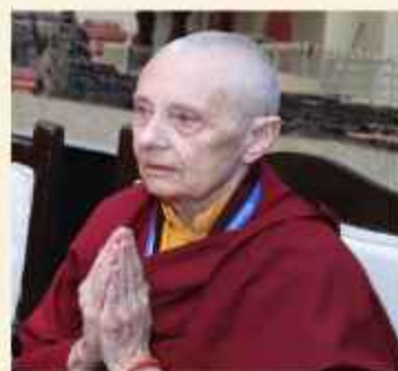
Most Ven Jetsunma Tenzin Palmo

The Ven became one of the first westerners to be ordained as a Tibetan Buddhist monastic in 1964. The turning point came in 1976 when Jetsunma sought deeper seclusion. High in the Himalayas, she found a cave at 13,200 feet above sea level, where she lived in solitary spiritual practice for 12 years,