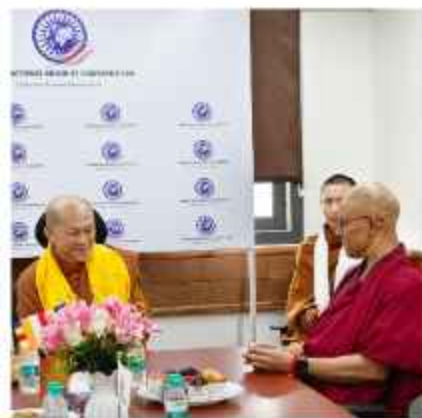
Most Venerable Aryawangso Buddhapojharipunchal Forest Monastery, Thailand