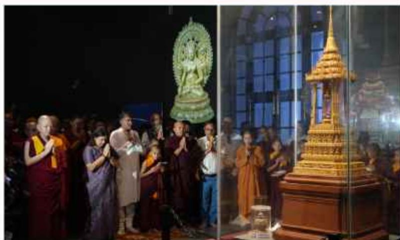
Prayers at The Holy Buddha Relic on 5 May, 2023

The Buddha's message of peace, non-violence and to follow the path of truth is as relevant today as it was 2550 years ago, said Smt. Meenakashi Lekhi , Minister of State for External Affairs and Culture, Govt of India, adding that "we not only need to recall them, but also carry them forward to the next generation; as it has been handed down to us through all these past centuries."