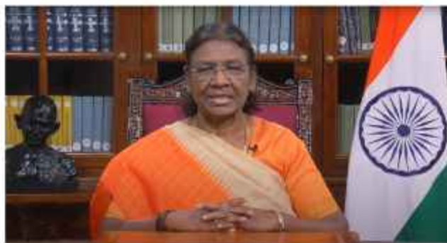
Hon'ble President of India, Smt. Droupadi Murmu delivering a video message at the Asadha Purnima celebration

The President was addressing the celebrations of Asadha Purnima on 3 July 2023, organized by the International Buddhist Confederation (IBC) with the support of the Ministry of Culture, Govt. of India. She explained that on Asadha Purnima Lord Buddha through his first sermon planted the seeds of the middle path of