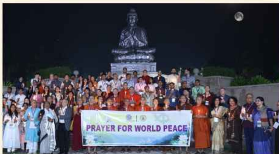
Participants at the conference gather at the statue of Shakyamuni Buddha, GBU for the candlelight peace march

As the world goes through turbulent times and conflict is visible all around, the Buddhist Scholars and academicians from different countries who had gathered at the GBU were in deep discussion and thought on how would this peace march contribute towards spreading the message of world peace based on the teachings of Dhamma.