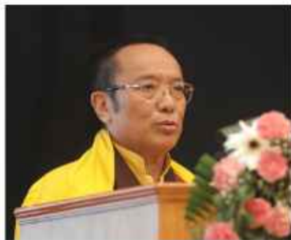
His Holiness The 12th Chamgon Kenting Tai Situpa

event was held at The National Museum, New Delhi where the Holy Relic of the Buddha from Piprahwa is placed. It is the annual flagship event of IBC and the second most sacred day for Buddhists after the Buddha Purnima or the Vaisakh Purnima.