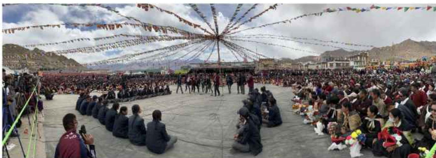
Over 8,000 participate at the colorful Buddha Purnima Celebrations, Polo Ground, Leh-Ladakh

At the colourful celebration of Buddha Purnima on 5 May, 2023, with the participation of over 8,000, representing leading public personalities, monks, lay citizens and members of all faiths, IBC in collaboration with the Ladakh Buddhist Association (LBA) and All Ladakh Gonpa Association (ALGA) marked the Holy day with great pomp and show.