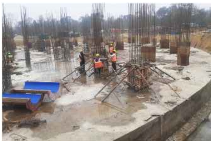
Construction of India International Centre for Buddhist Culture and Heritage (IICBCH) in progress at Monastic site, Lumbini, Nepal

T he construction of the IICBCH project has been proceeding smoothly after some hindrance due to the monsoons. The project was held up briefly because of heavy rains during the monsoon season which had flooded the dug-up portions of the land.