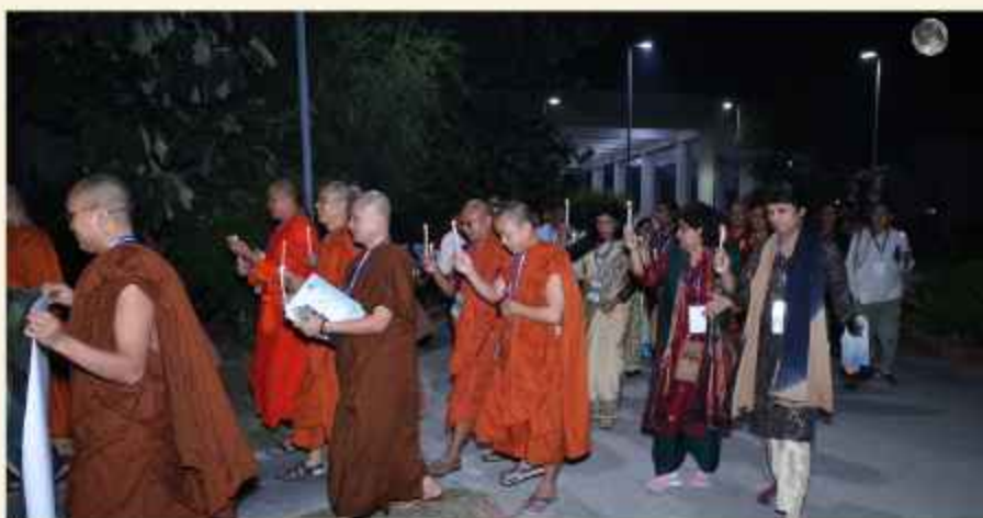
Silently marching for hope, peace, and a brighter future for the world

It was a symbol of hope, peace, and a brighter future, leaving a lasting impression on the hearts and minds of all who participated and witnessed it. □