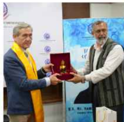
H.E. Mr. Nambaryn Enkhbayar Former President of Mongolia