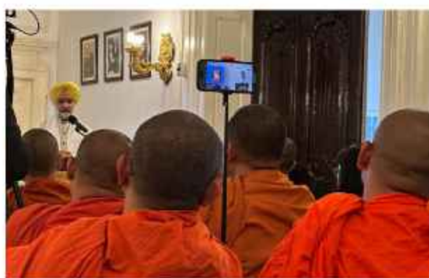
Monks at the Indian Embassy in Washington, US