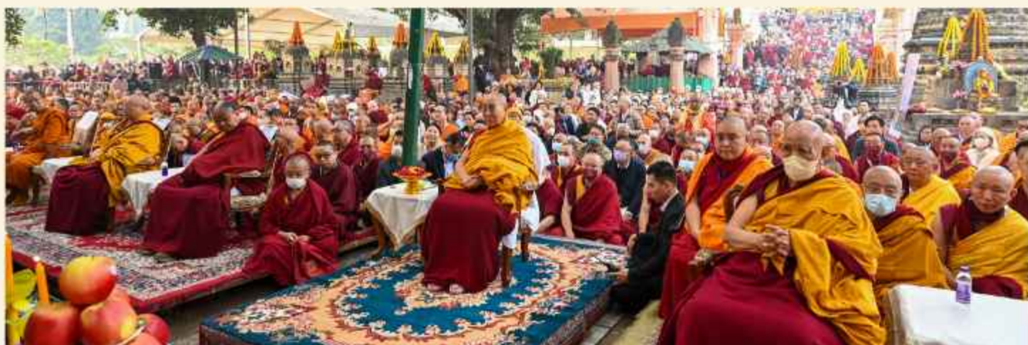
His Holiness the Dalai Lama addressing the congregation gathered at the Mahabodhi Temple to join in prayers for world peace in Bodhgaya

"Bridging Traditions, Embracing Modernity"