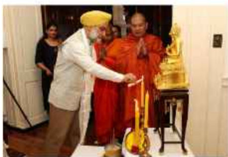
Indian ambassador to the United States, Taranjit Singh Sandhu inaugurates the Buddha Purnima celebrations in Washington, USA

In continuation of the Vaisakh Day programmes, The Embassy of India in Washington D.C. on 5 May 2023 celebrated Buddha Purnima in association with the International Buddhist Association of America (IBAA) and the International Buddhist Confederation (IBC). The event was attended by venerable monks, scholars, and members of the Indian diaspora.