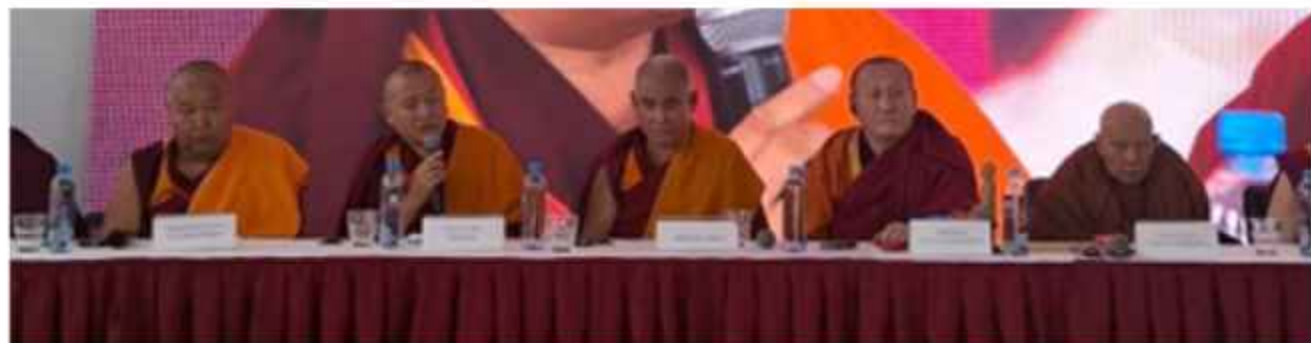
At the inauguration of the International Buddhist Forum, Ulan-Ude, Republic of Buryatia, Russia

He also visited the Myanmar Pagoda at Etnomir. The Forum was an attempt to bridge the gap between traditional Buddhist values and the complex challenges of the modern era, bringing together diverse representatives from around the world, fostering meaningful interactions, and generating tangible outcomes in the form of resolutions and collaborative initiatives. □