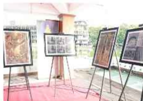
Exhibition on Ajanta Caves in Colombo Sri Lanka

like to reiterate that the International Buddhist Confederation (IBC) is committed to providing a unified platform for all Buddhist traditions and organizations worldwide and to ensure that the path of Dhamma remains relevant in society's changing landscape," he said in conclusion. □