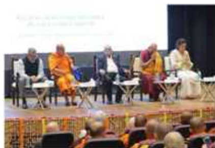
Prayers at the opening of the event in New Delhi